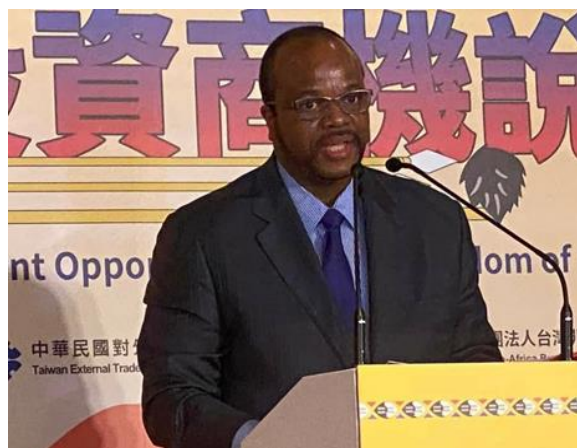
King Mswati III was invited to deliver speech during the seminar.